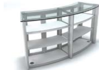
Kit form - semi