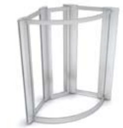
Kit form - base