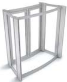
Kit form - base