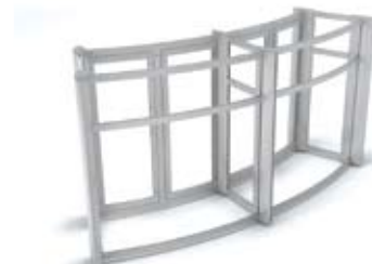
Kit form - base