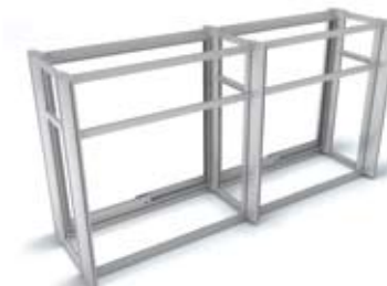
Kit form - base