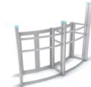
Kit form - base