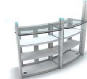
Kit form - semi