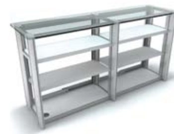
Kit form - semi