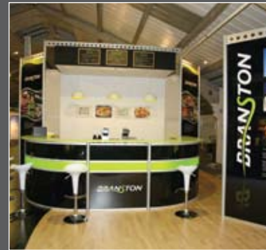
Branston Exhibition Stand courtesy of Viva Imaging.