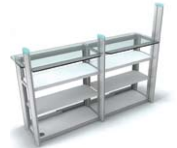
Kit form - semi