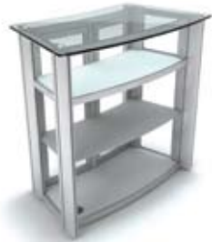
Kit form - semi