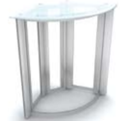
Kit form - semi