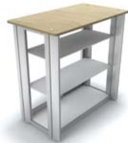
Kit form - semi