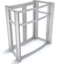
Kit form - base