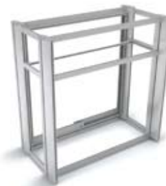
Kit form - base