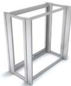
Kit form - base