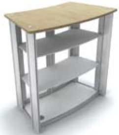
Kit form - semi