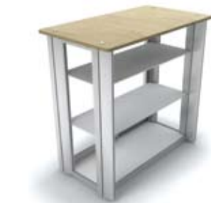
Kit form - semi