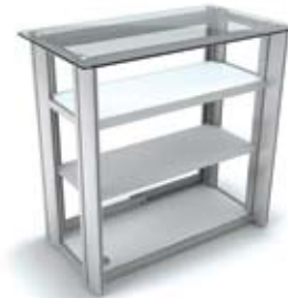
Kit form - semi