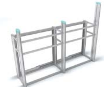
Kit form - base